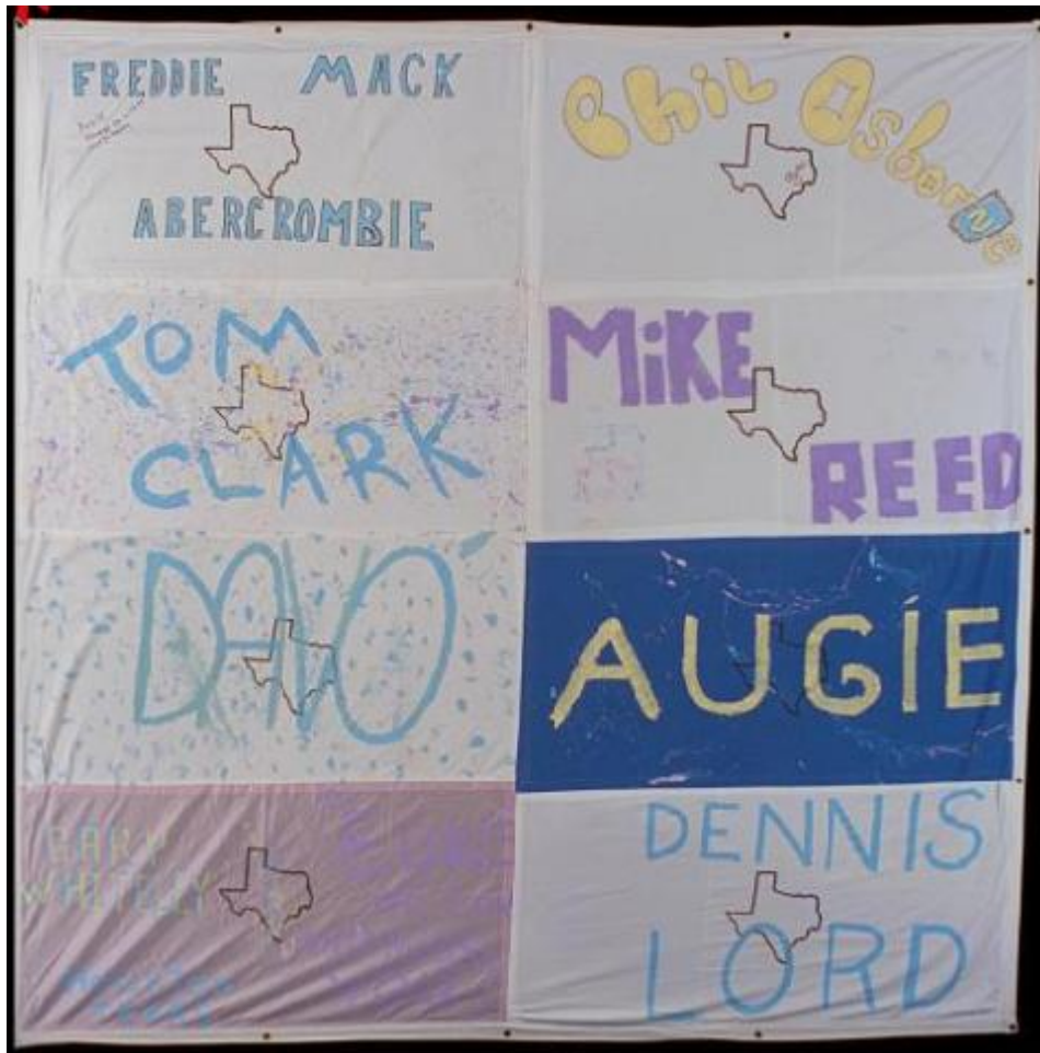
Names on Block #118